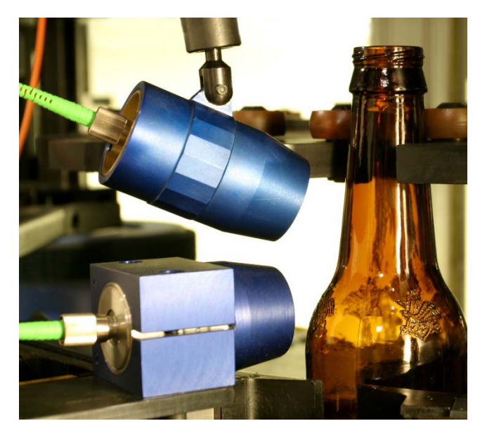
The new Emhart Glass chromatic system's transmitters and receivers can be mounted from the check detection rings of the Veritas iM and FleXinspect T and enable greater flexibility for wall thickness inspection.

As of 1 October, the chromatic system will be offered as the preferred wall thickness inspection option on the Veritas iM, in addition to the currently-available optical inspection system based on the VMA thickness measurement technology. Both the Precitec M4 CHRocodile and VMA TMC and WRH thickness measurement system will be available as options for both the Veritas and FleXinspect systems.