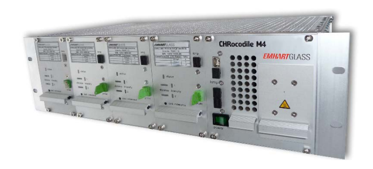
Electronics are housed in a single rack-mount console.

The new Emhart Glass chromatic wall thickness system also includes a single rack-mount electronic console. All inspection setup is completed using the Veritas user interface and screens.